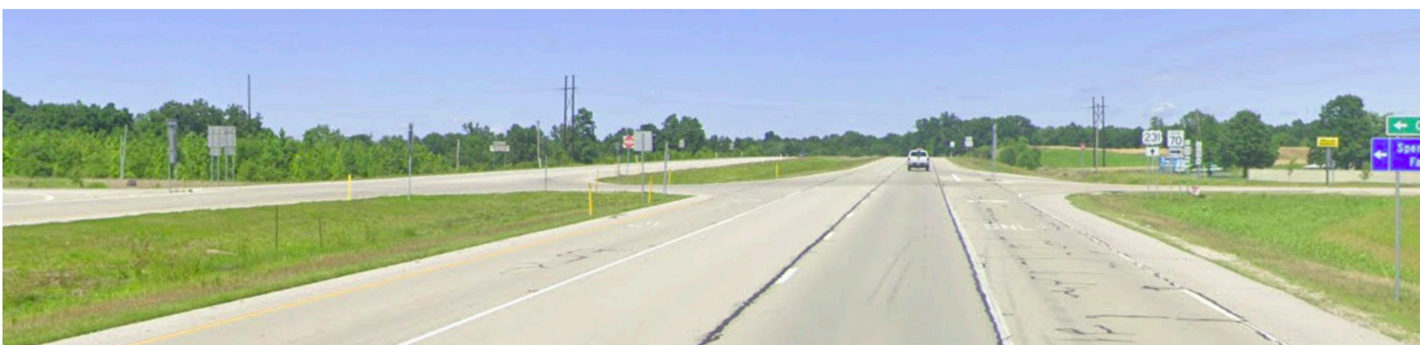
US 231 in Spencer County