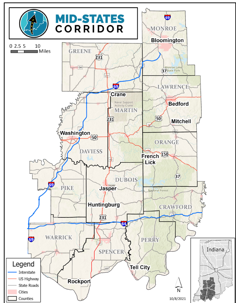
Figure 1-1: Mid-States Corridor Study Area

The needs assessment uses a 12-county Study Area ( Figure 1-1 ). This Study Area includes counties bounded by I-69 on the west and north, SR 37 on the east and the Ohio River on the south. The Study Area includes the entirety of all counties through which either I-69 or SR 37